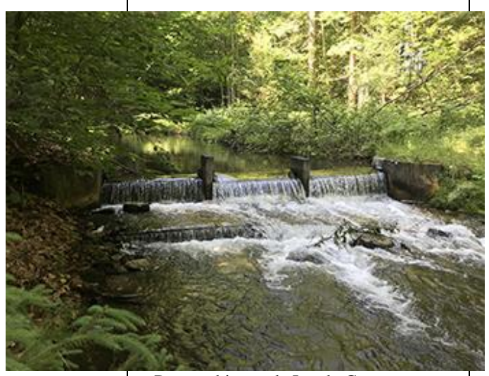
Partnership and Land Conservancy and the U.S. Forest Service.

moving over the waterways. Partners include the Conservation Resource Alliance, Huron Pines, the Little Traverse Bay Bands of Odawa Indians, Michigan Trout Unlimited, the Muskegon River Watershed Assembly, the Superior Watershed