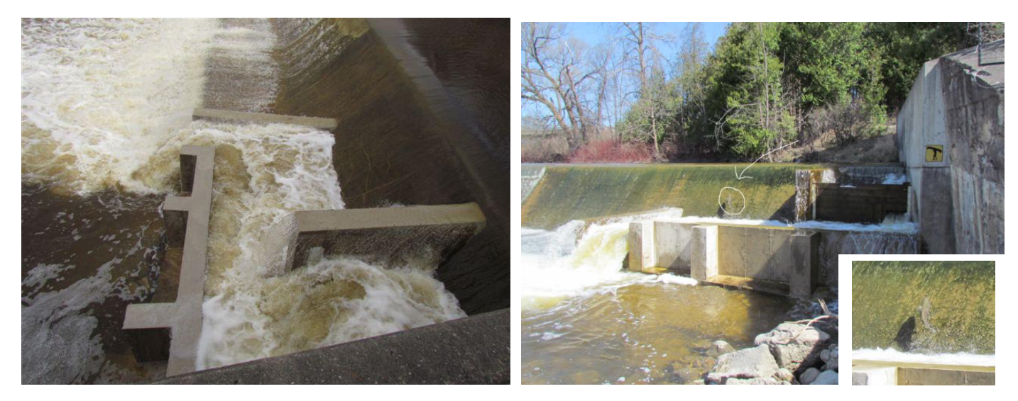
Top view of the new fishway at Maple Hill Dam

The next barrier upstream from Walkerton remains Maple Hill dam. Again, the same dedicated parties completed the first construction stage of the 'new' Maple Hill fishway last fall. Although this newly constructed fishway requires a bit more 'fine tuning', fish were seen successfully navigating this fishway. Maple Hill Fishway construction will be completed this summer.